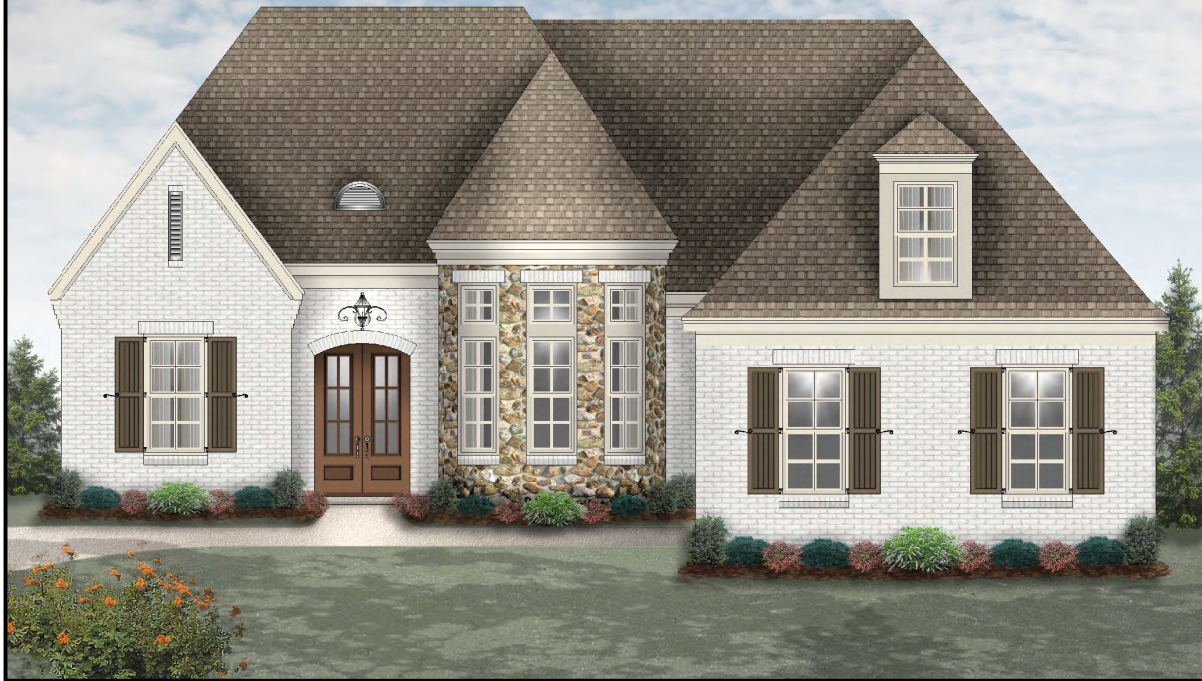
Photo or Rendering May Not Reflect Changes Made in Field.