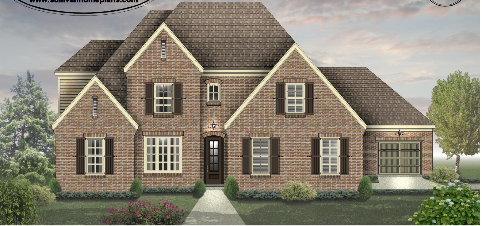
Photo or Rendering May Not Reflect Changes Made in Field.