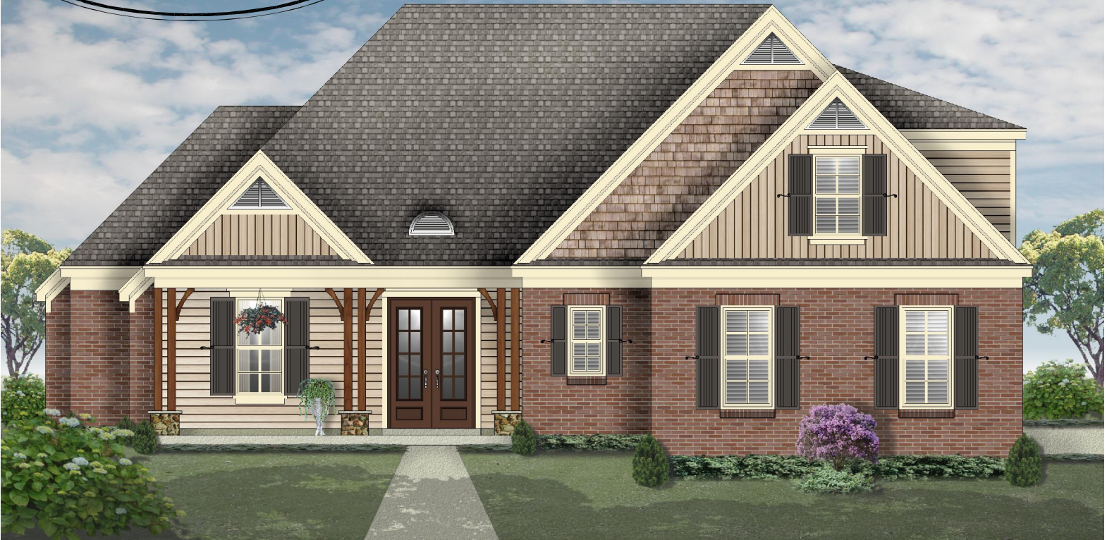
Photo or Rendering May Not Reflect Changes Made in Field.

SQUARE FOOTAGE 1933 HEATED DOWN 573 HEATED UP 520 GARAGE & STORAGE 250 FRONT & REAR PORCHES