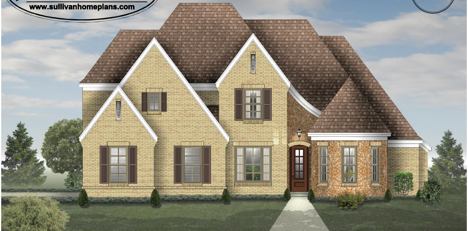
Photo or Rendering May Not Reflect Changes Made in Field.