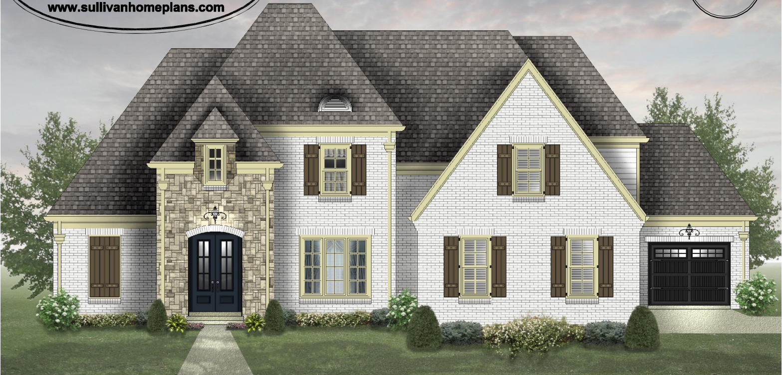
Photo or Rendering May Not Reflect Changes Made in Field.